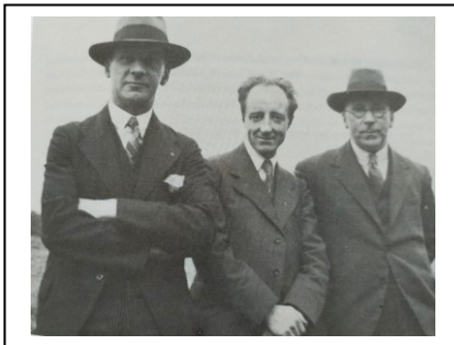
The heroes of Penyberth - Lewis Valentine, Saunders Lewis and DJ Williams

The story of the burning of the Bombing School in the early hours of 8 September 1936 has been told in detail - and been the subject of poetry and song.