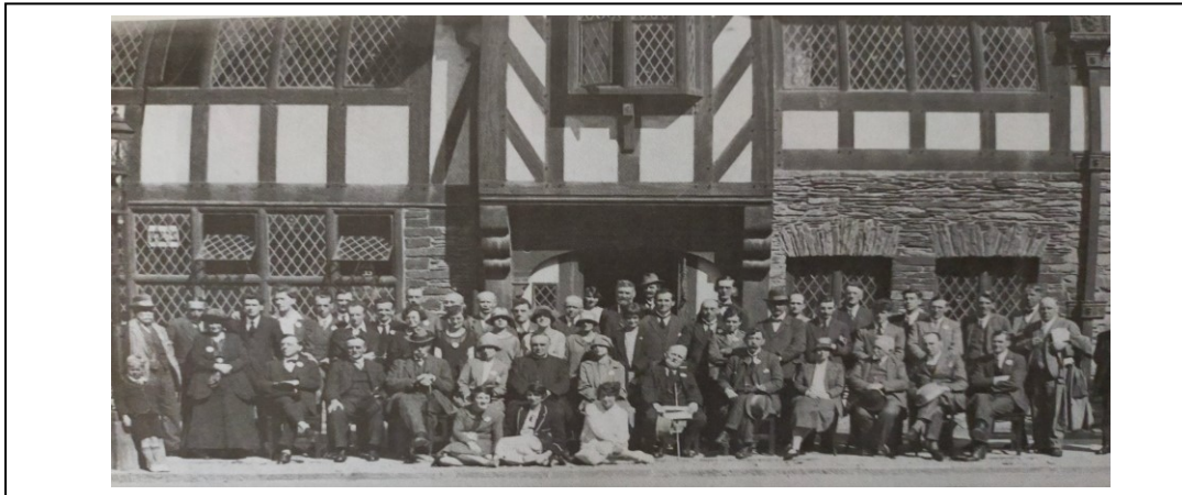
A year after foundation - Plaid Cymru's Summer School, Machynlleth, August 1926, thought to be the first photograph taken of party members