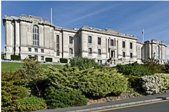
National Library of Wales, Aberystwyth

Despite delay caused by the Covid pandemic, members of the Plaid Cymru History Association will be pressing ahead during the year with an important project to update a record of the party's publications - and make them available worldwide.